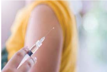
HEALTH & WELLNESS CONTINUED ON PAGE 2

The Centers for Disease Control and Prevention (CDC) endorsed the safety and effectiveness of the Pfizer-BioNTech COVID-19 vaccine for everyone age 12 and up. This announcement expands vaccination to 17 million additional adolescents throughout the country.