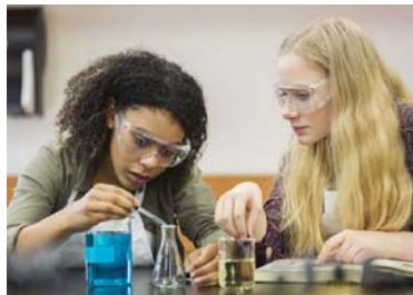
EMPLOYMENT CONTINUED ON PAGE 2